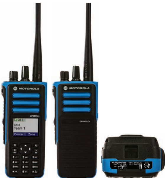
DP4801 Ex (Display) DP4401 Ex (Non-Display)

The MOTOTRBO DP4000 Ex Series combines the best of two-way radio functionality with the latest digital technology. It integrates voice and data seamlessly, offers enhanced features that are easy to use, and delivers increased capacity to efficiently connect all your crews. With exceptional voice quality, long battery life and ATEX-rated for safety, the DP4000 Ex Series keeps your workers connected safely and productively, wherever the job takes them.